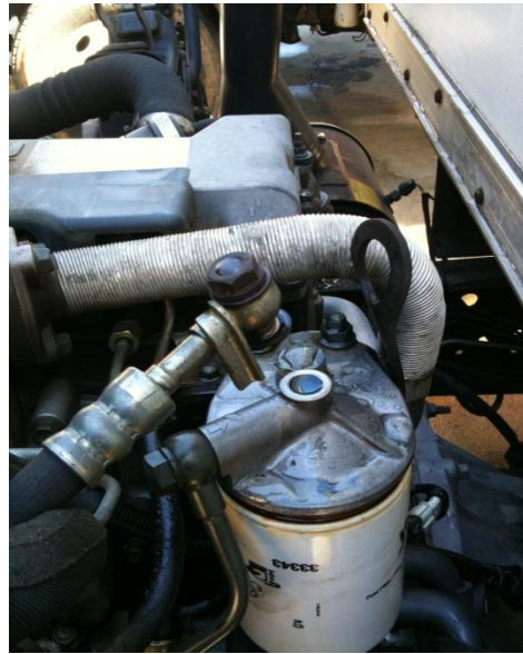
Figure A-B: Here you see the metal housing for the fuel filter. Remove the 14mm bold with a 17mm socket. This makes it easier to install the hose menders after the line is cut.